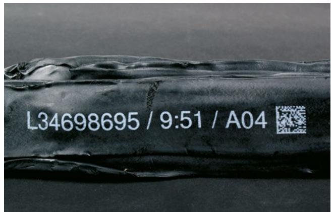
2D code on non-vulcanized rubber, printed with large character ink jet system

In order to create a high-quality marking (logos and graphics), stencils are still being used today. The cost-intensive change of stencils and the unflexible use are just two disadvantages. The REA JET high-resolution marking systems are able to print brand logos, 2D codes or other markings in high quality.