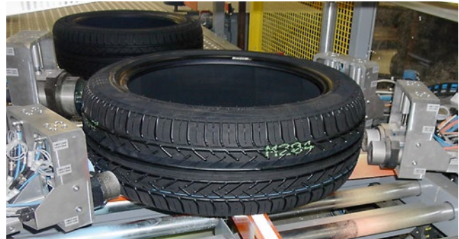
Colored stripe marking of finished tire

The coding of components or finished products with colored lines is a commonly used method for type-identification. REA JET offers various alternative coding and marking technologies for automated line marking on raw material, pre-products or the finished tires.