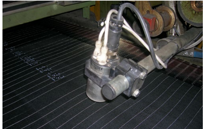
Alphanumeric productcode on texture cord

For identification purposes, the components are marked with a production code. The composition of the REA JET inks ensure that the connection of the individual components in the tire is not impaired.