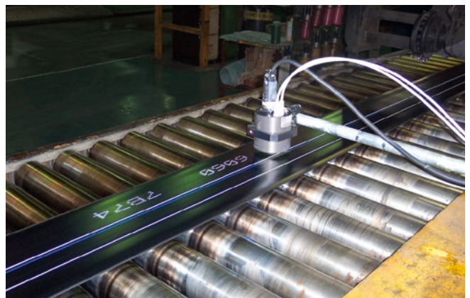
Alphanumeric printing on tire tread

The REA JET DOD inkjet systems replace indenting wheels and mark products contact-free and automated via data connection. This eliminates incorrect prints and lowers the reject rate. Furthermore, there are water-based inks available which support an environmentally friendly production.