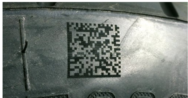
Captive marking by laser on finished tire with 2D code

If a permanent marking of the product throughout its entire lifecycle is required, then laser marking is the first choice. By minimal material removing (engraving) a captive identification with text and graphics is achieved. A 2D code applied to the sidewall of a tire can be automatically read and can provide a history report for traceability purposes. REA JET Laser Systems can be characterized by long service life, low maintenance costs and a consumable-free operation.