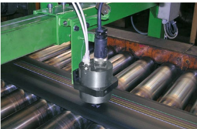
Alphanumeric marking on raw rubber tread