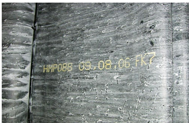
Production code applied to rubber compound