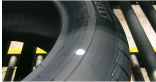
High point marking

The REA JET spray mark technology systems are applicable in multiple ways in the tire and rubber industry. Some examples are the application of colored dots, high points or marks for quality identification.