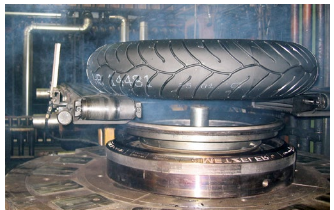
Coded tire after vulcanization