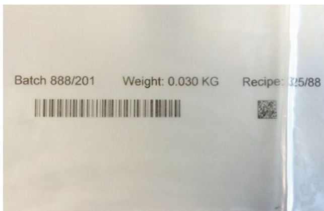
Alphanumeric marking, 2D code and barcode on EVA bags