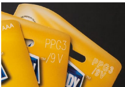
Writing on card