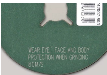
Writing on sanding discs