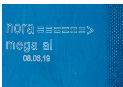
Marking of composite materials