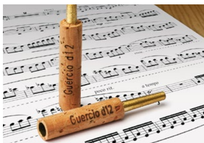
Writing on cork