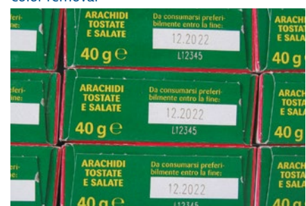
Writing on cardboard boxes