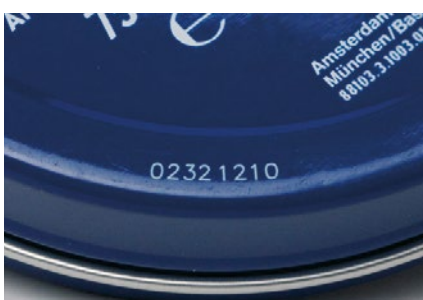
Writing on painted tins

TITAN The REA JET TITAN Platform. The single operating concept for all REA JET technologies.