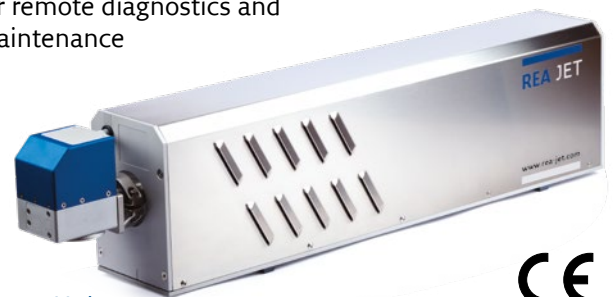
CL Laser Unit