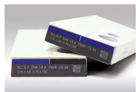
Coding and marking of packaging through color removal