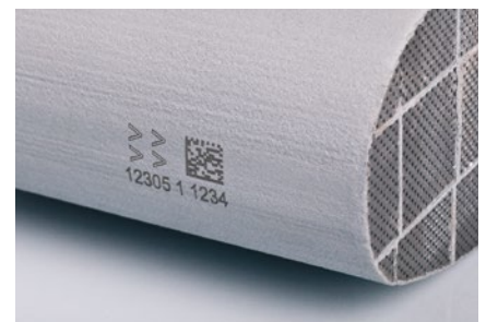
2D Code marking of soot particle filters