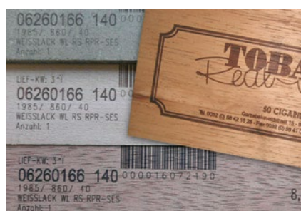
Marking of wooden profiles