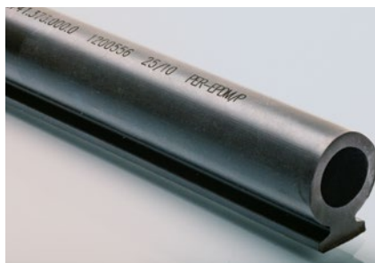
Marking of rubber profiles