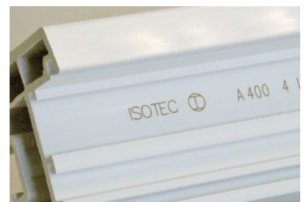
Marking of plastics